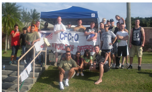
III MEF Carwash